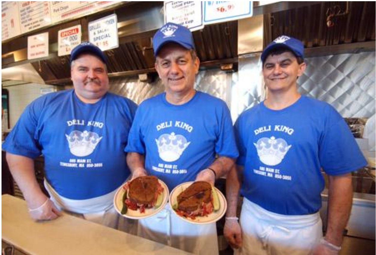
Photo: Deli King workers. This looks like corned beef to me. Also: note the Hot Dog “Special” featured in the back. Highly recommended! Why? I’ve never had a bad meal here so it must be good! These guys do a great job! You know what also would be great? Not just chocolate chip pancakes...but “fudge” pancakes. Maybe we can talk them into it!