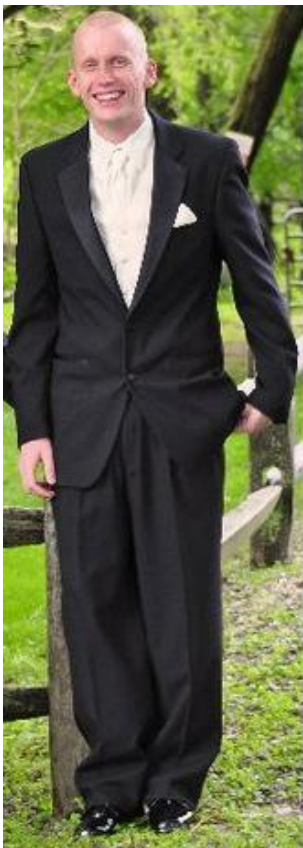
Photo: I don't think I've ever dressed this nice in my entire life. In fact, I'm sure of it.